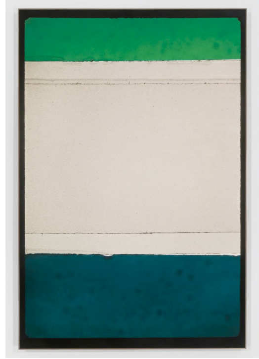
Francisco Ugarte Abstract Slide Photograph 4, 2016 Cristin Tierney

The resulting series of images may be non-narrative, but the slides are nevertheless arranged in a certain order. Viewing the automated progression, which is projected onto